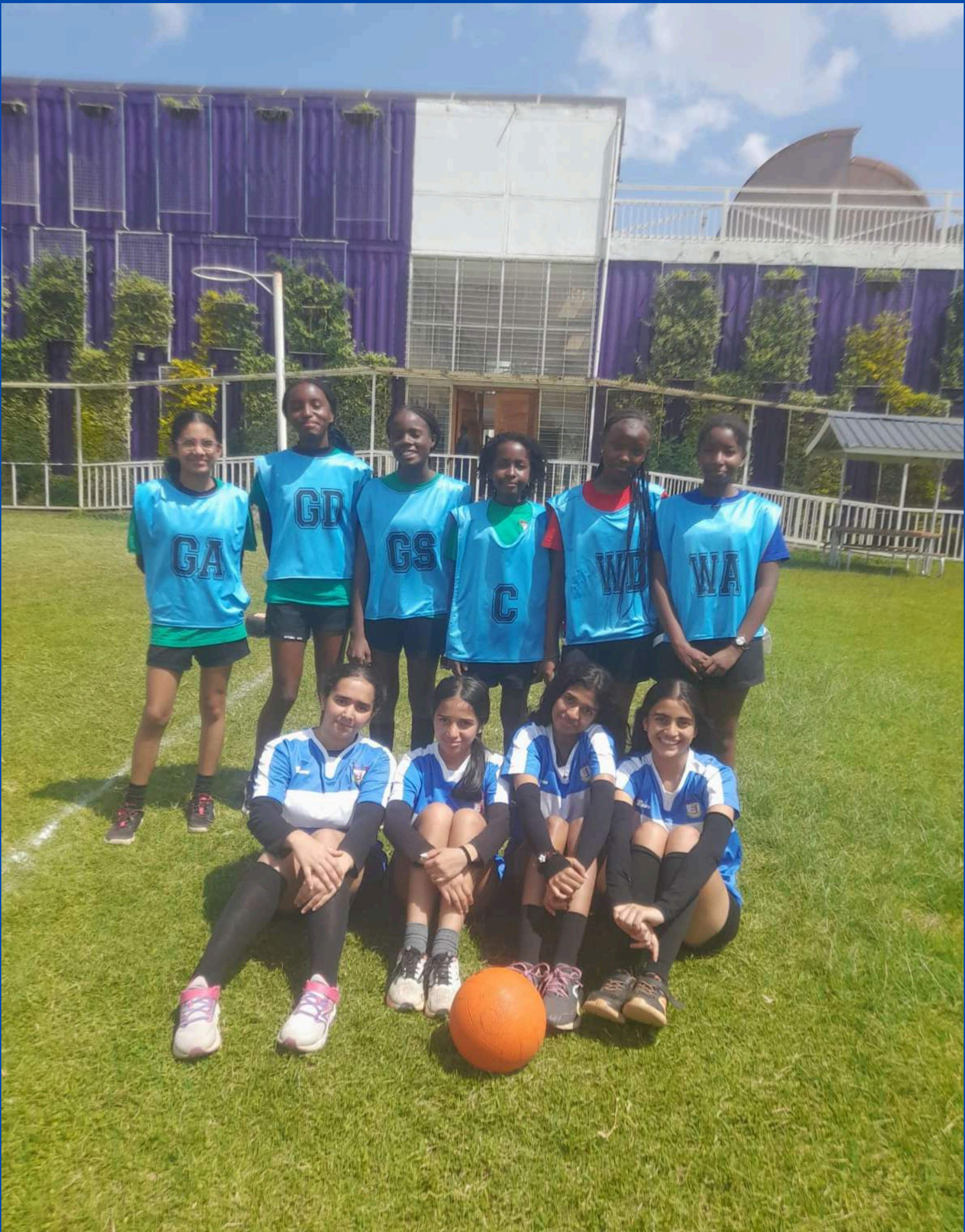
The U13 Girls' Netball Team played a friendly match against St. Austin's today. It was tightly contested, ending with Oshwal 9, St. Austin's 11.