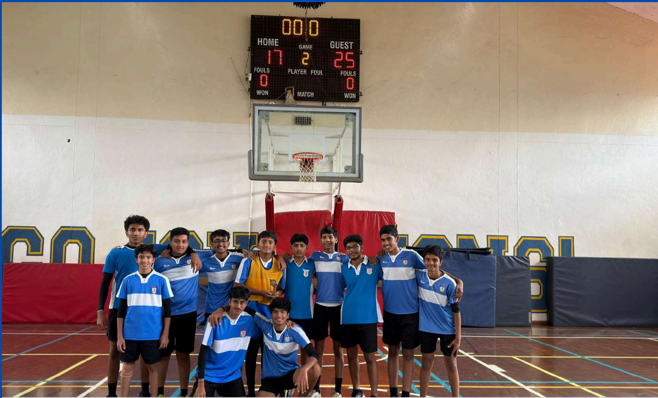
Our U14 Boys' Volleyball Team competed in the ISK Invitational Tournament, topped their pool, and went on to win the championship by defeating ISK 2-0 in the finals.