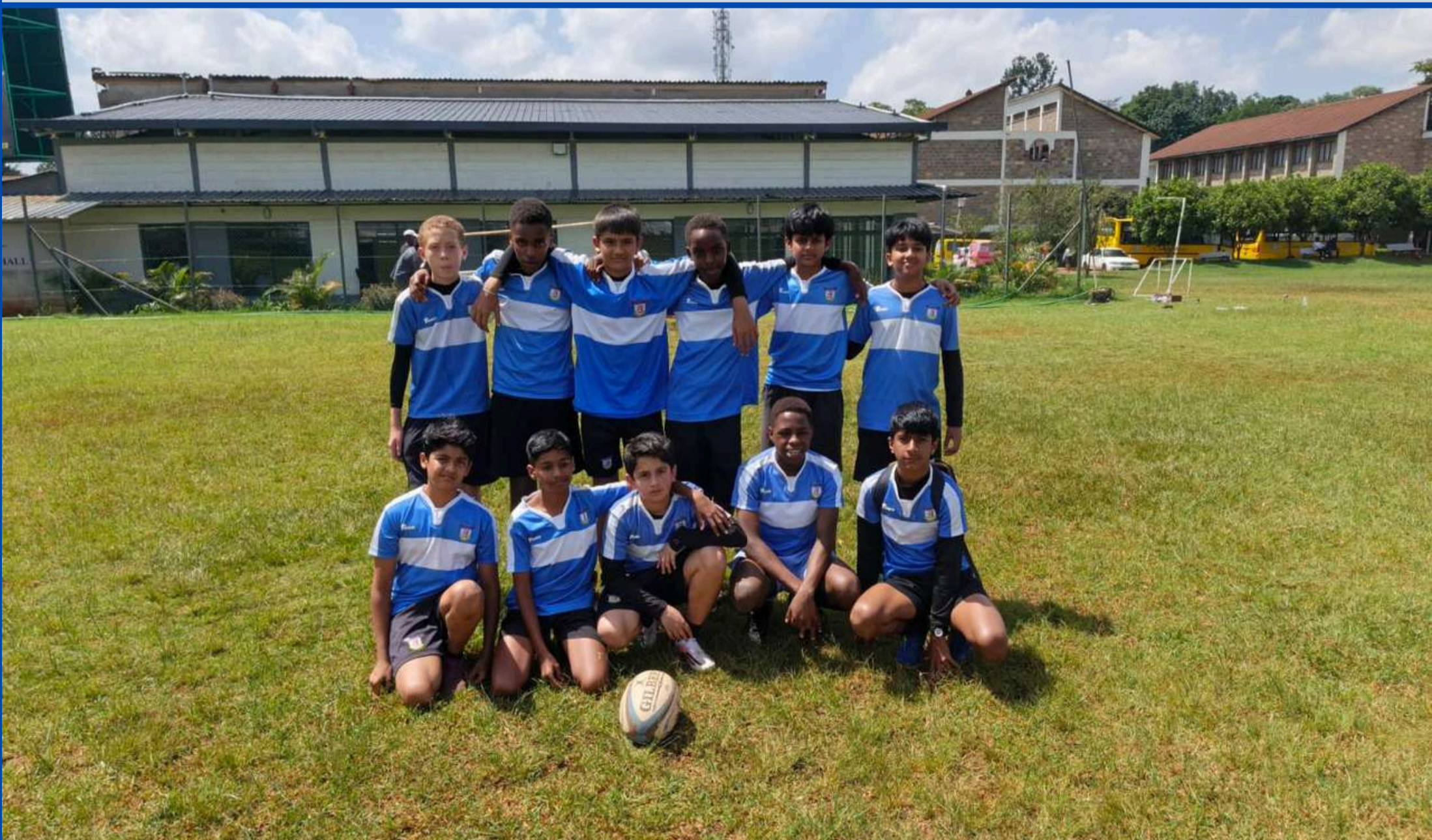
The U13 Boys' Rugby Team played against St. Austin's at their grounds today, winning with 9 tries to 8.