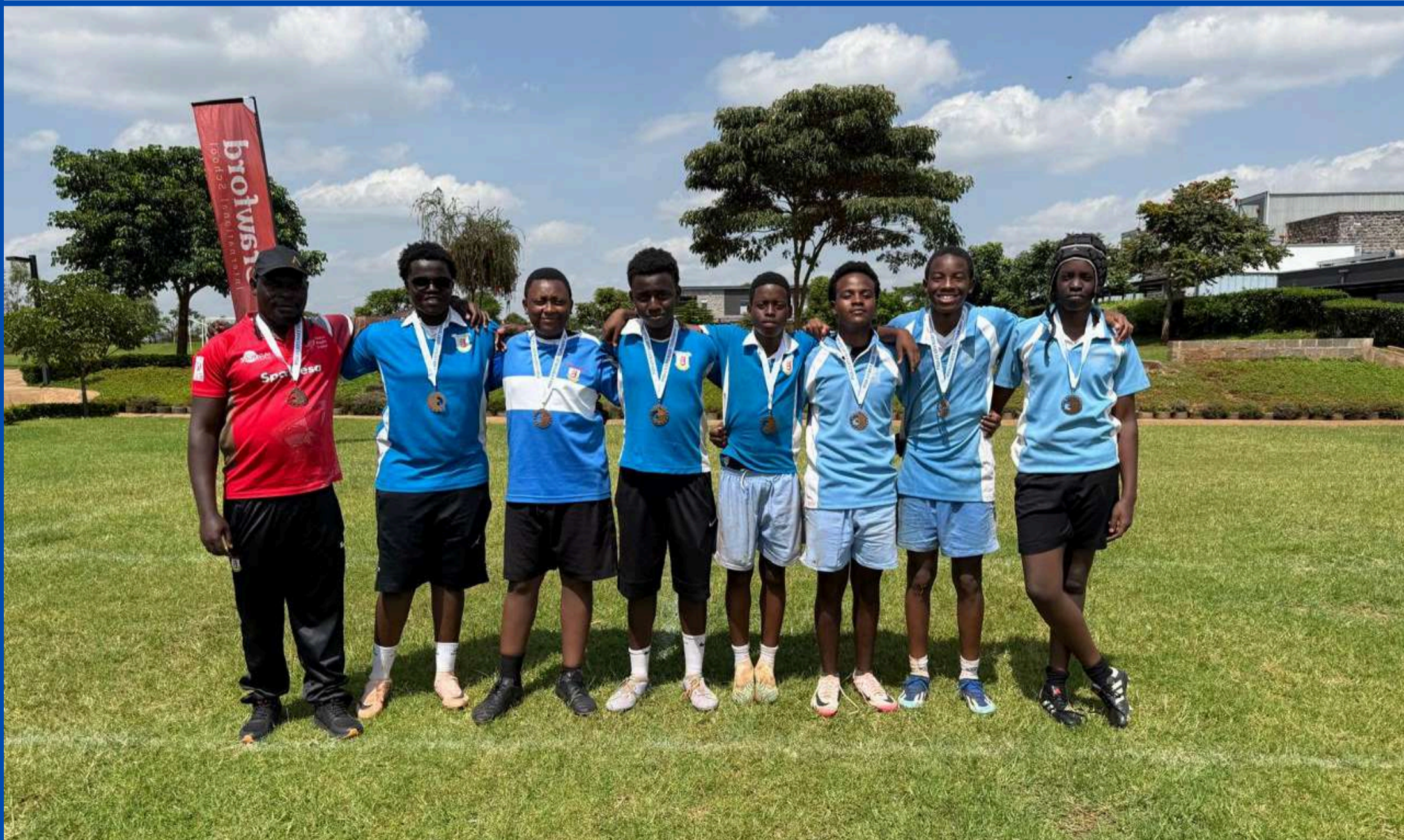
The U15 Boys' Rugby Team won a Bronze medal in the IPSSA tournament hosted at Crawford International School.