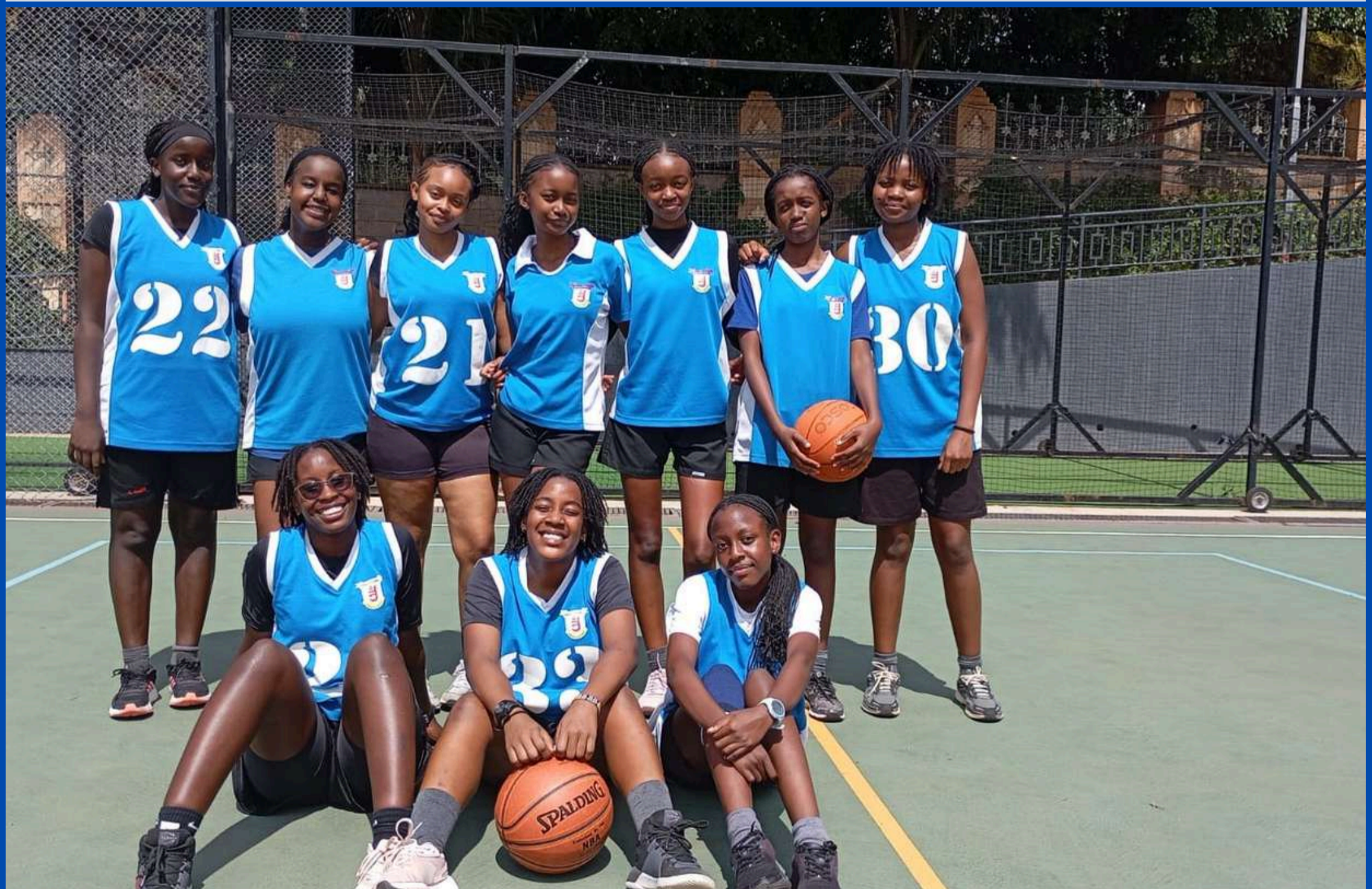
U15 girls Basketball delivered a win after beating Rusinga 18 Baskets against 14 by the visitors