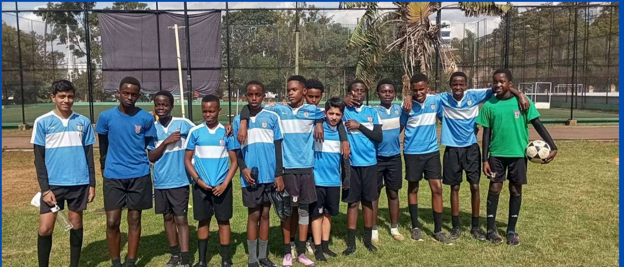
U13 boys Soccer team contested a fixture against Samaj, concluding in a 1-1 draw.