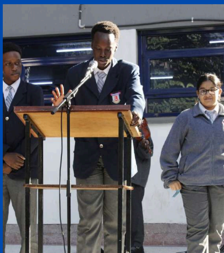
Announcements from some of the students.