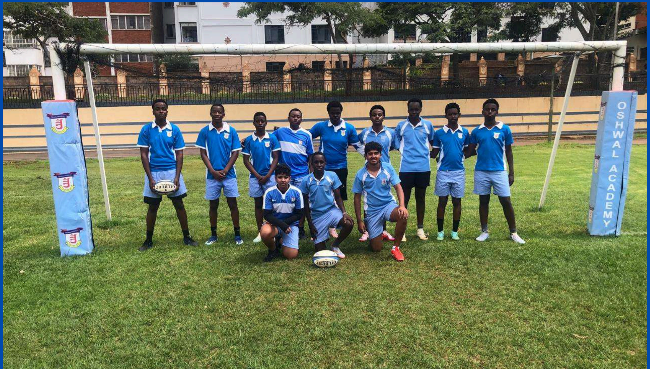
The U15 boys played their first Rugby match of the season against Rusinga. Oshwal team won 28:17