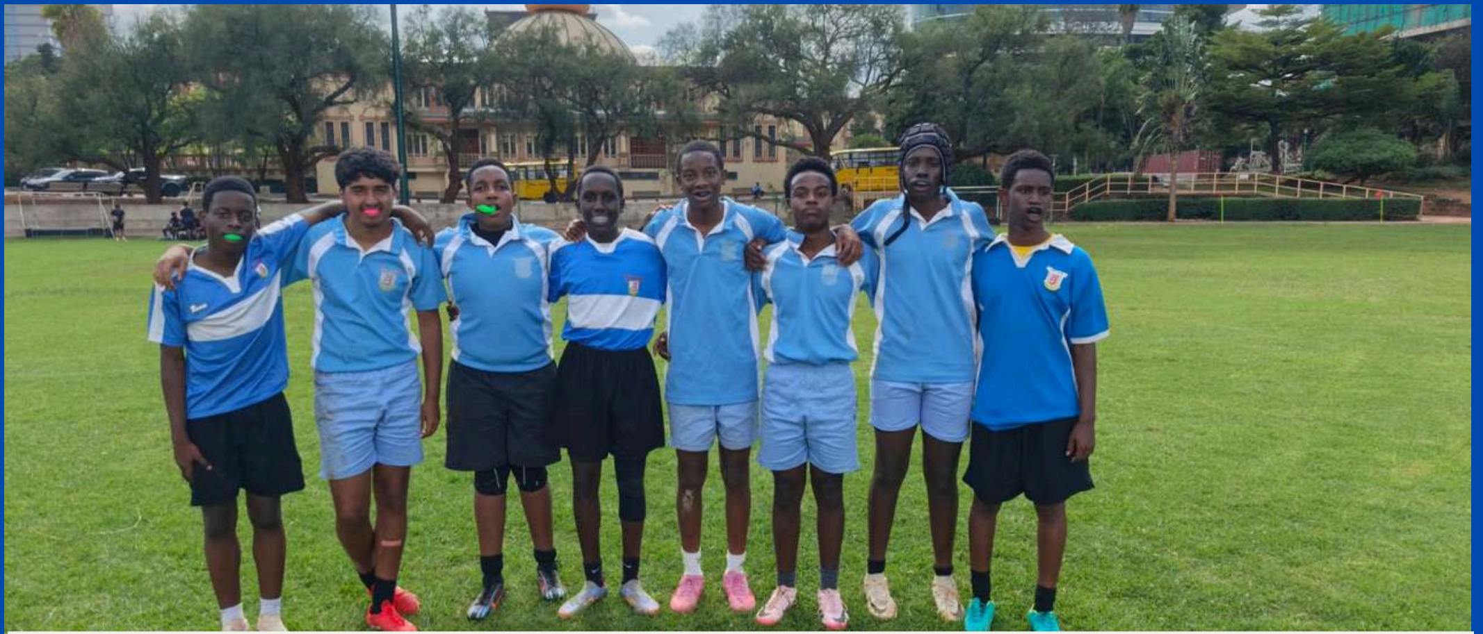
The U15 boys team played a Rugby fixture today, securing a 19-12 victory over Aga Khan.