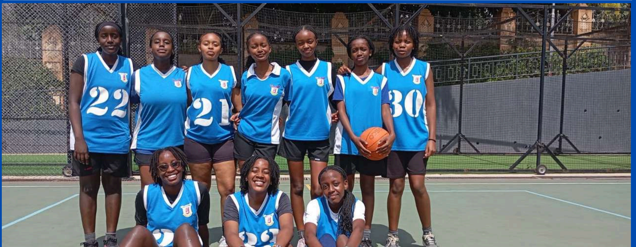
In the U15 girls Basketball tournament, Oshwallost to Aga Khan 15-32 but bounced back with a strong 31-5 victory over Light Academy.