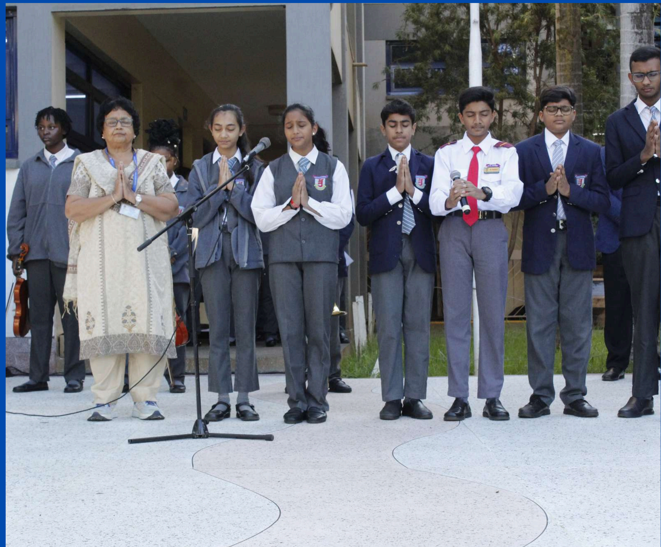
Students performing Jain Prayer at the assembly.