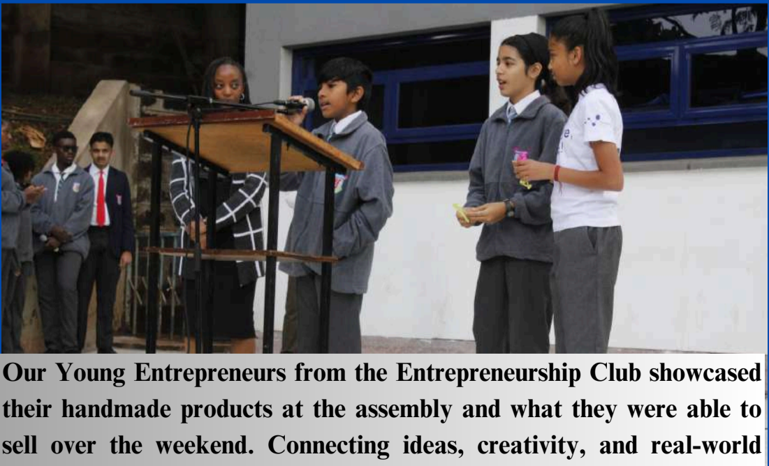
Our Young Entrepreneurs from the Entrepreneurship Club showcased their handmade products at the assembly and what they were able to sell over the weekend. Connecting ideas, creativity, and real-world business.