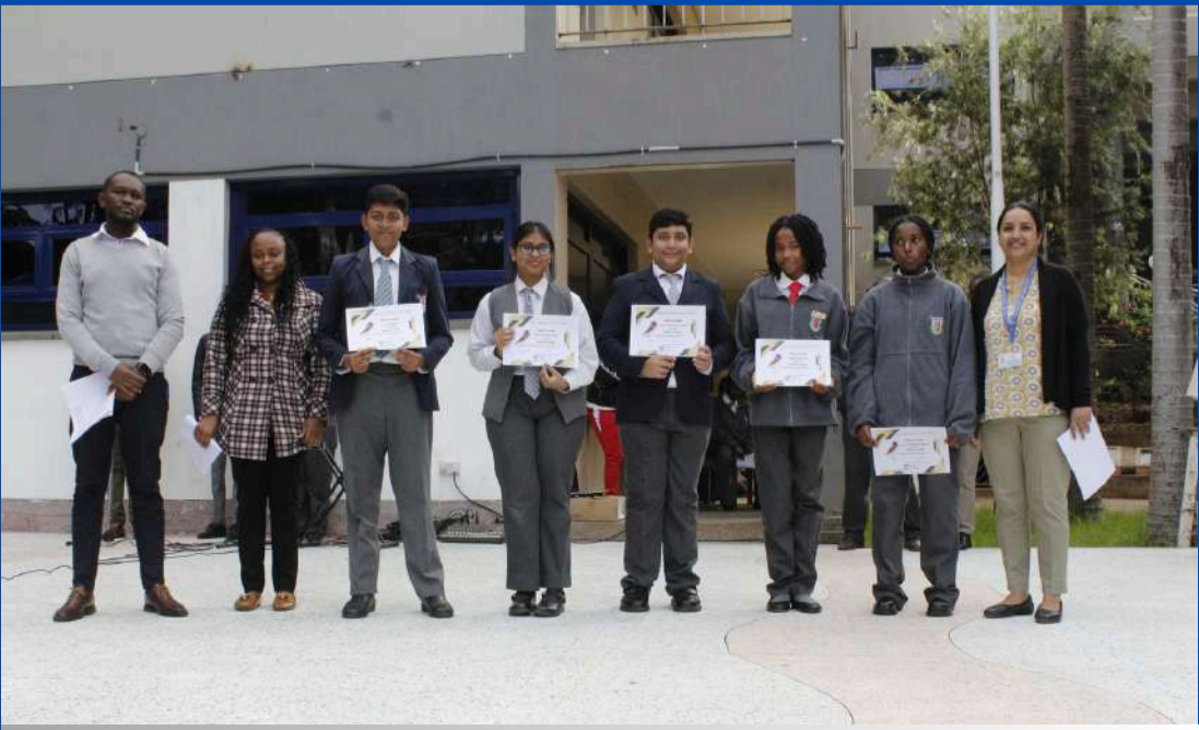
Celebrating a love for reading.