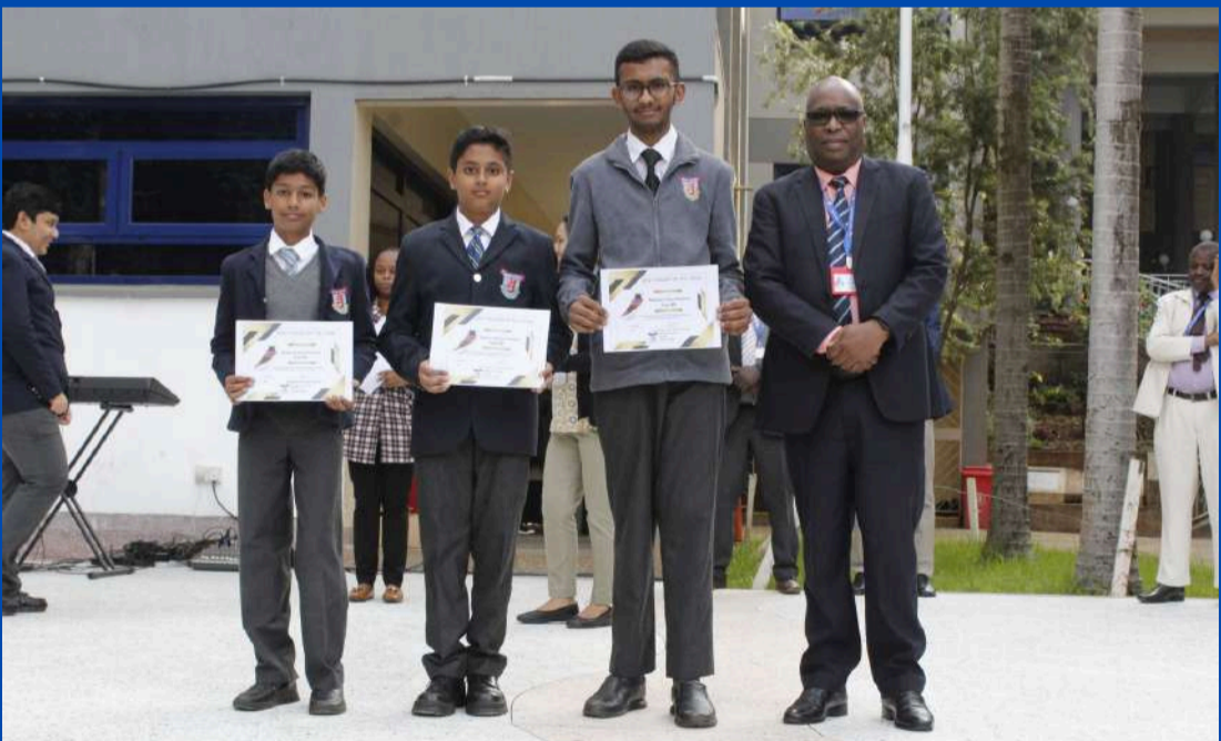
Our Young Entrepreneurs from the Entrepreneurship Club showcased their handmade products at the assembly and what they were able to sell over the weekend. Connecting ideas, creativity, and real-world business.