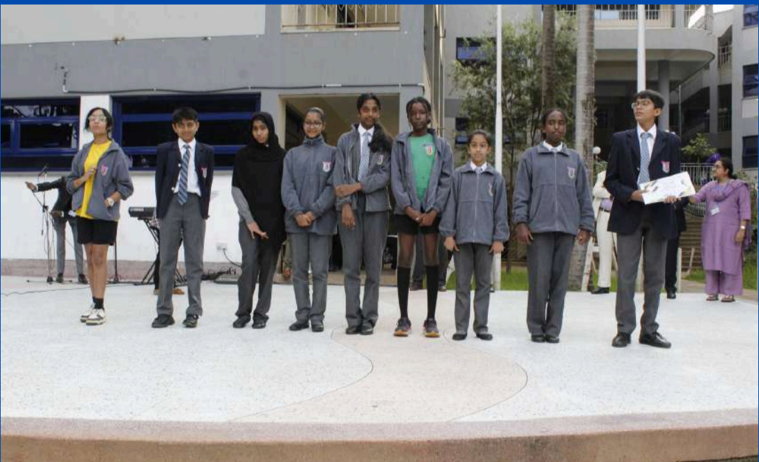
Our top readers from Years 7-10 were recognized and awarded at assembly. Inspiring a culture of curiosity and excellence.