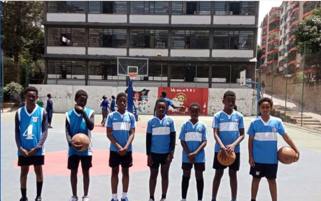
Against Brookhurst School Lavington, our under-13 boys' basketball team won 23 baskets to 11 baskets, while on the same venue they edged out Makini School 35 baskets to 23 baskets.

Join us in congratulating our under 14 girls hockey team—they attained runners-up position, hence they were awarded silver medals in the Peponi Invitational Tournament held at Peponi School.