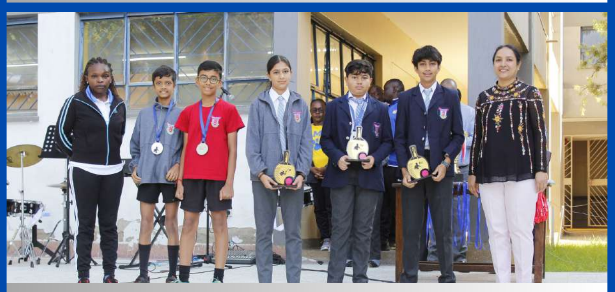
UNDER 13 TABLE TENNIS TEAM