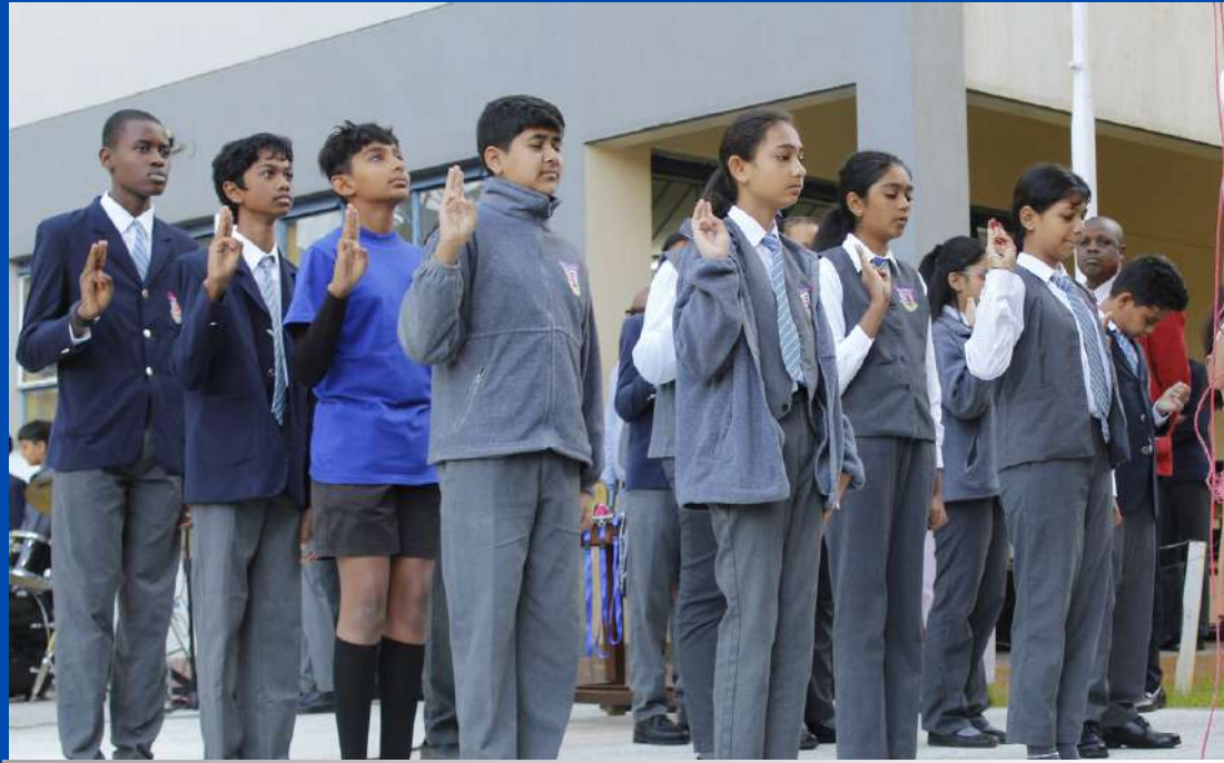
Student scouts take the lead in officiating the school assembly, demonstrating discipline, leadership, and teamwork.