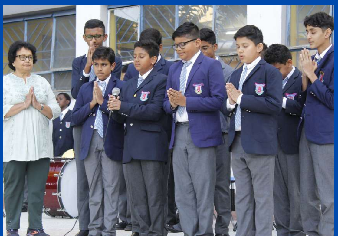
Students performing Jain prayer at the assembly.