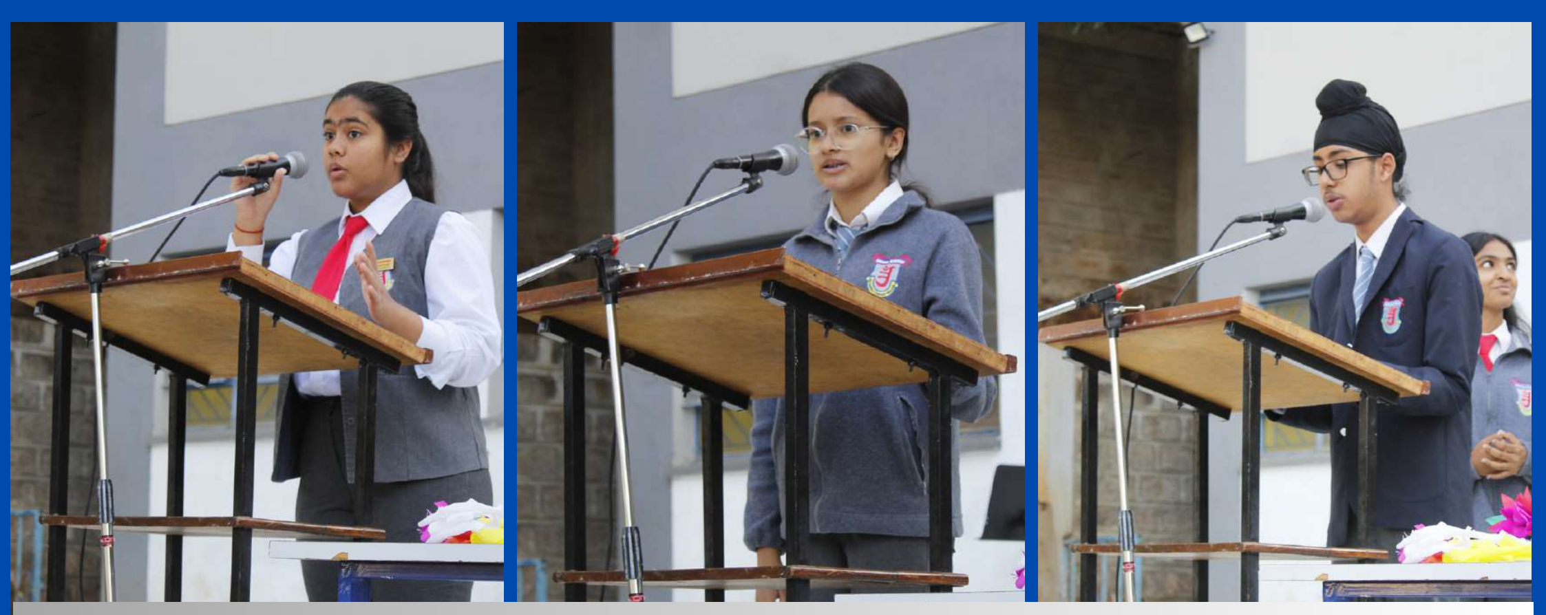
Announcements from some of the students.