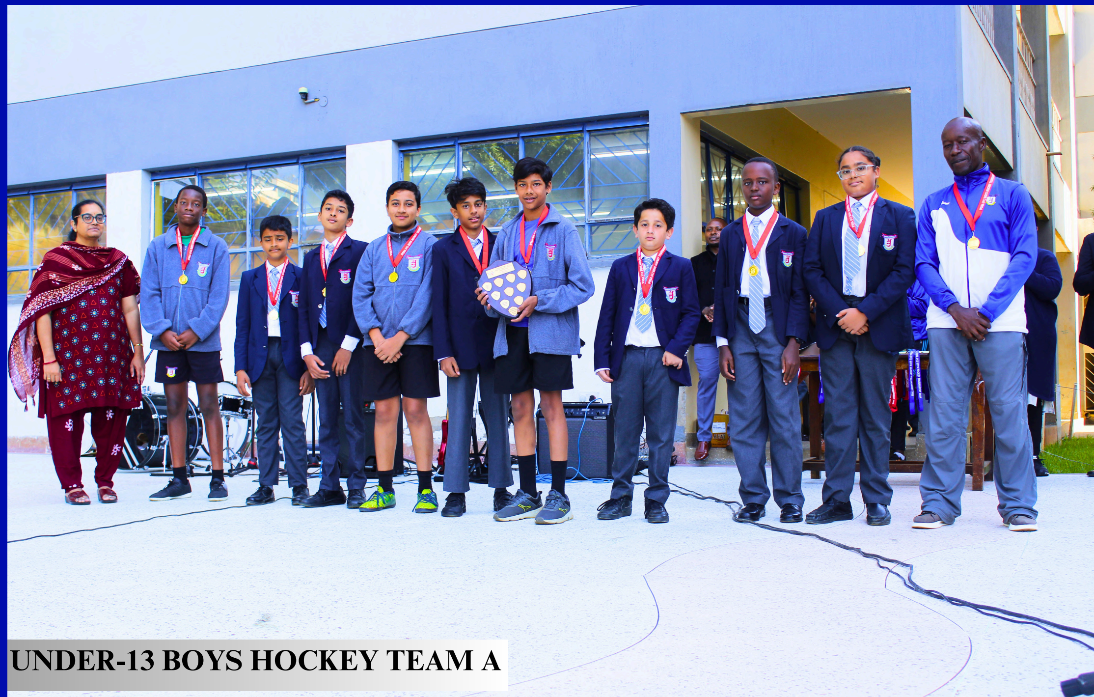
UNDER-13 BOYS HOCKEY TEAM A