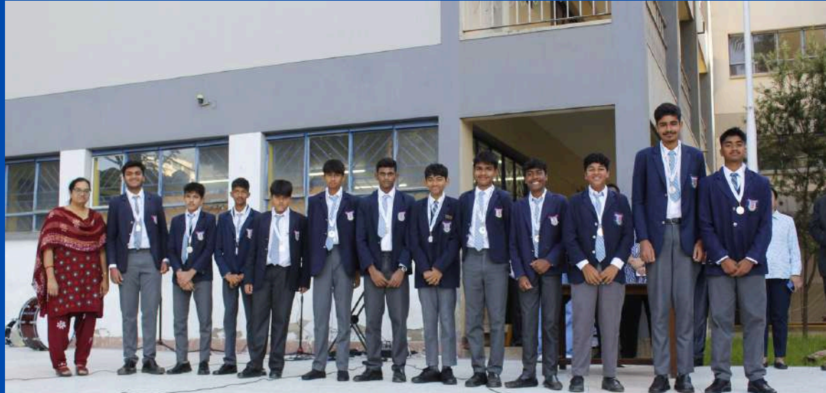
Under 15-Boys Cricket team pose for a picture with the Head of School after receiving their awards.