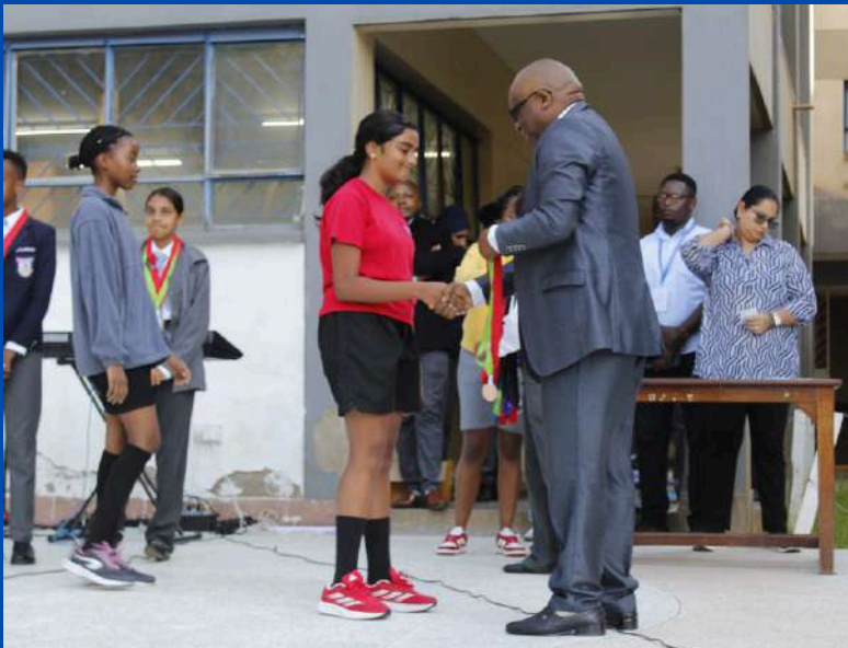
The Deputy Head of School awarding the swimming team that scooped 16 Gold , 7 silver and 6 bronze medals at the Developmental Swimming Gala.