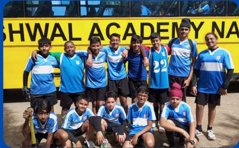
Our under-13 Boys Hockey team edged out Samaj School 3-1.