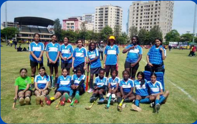
Our under-13 Girls Hockey team on their 2-goal win over Samaj School