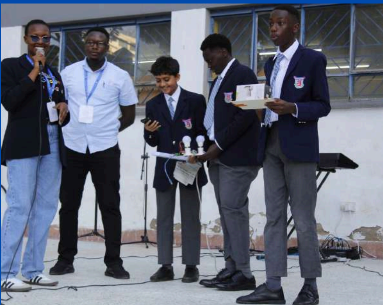
Students being introduced to Internet of Things (IoT) and how it is applicable in the current technology world, an example of smart homes was given.