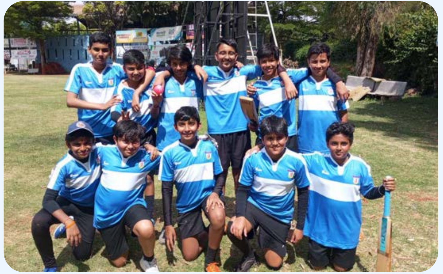
Against Samaj School, our under-13 boys' cricket team lost by nine wickets.