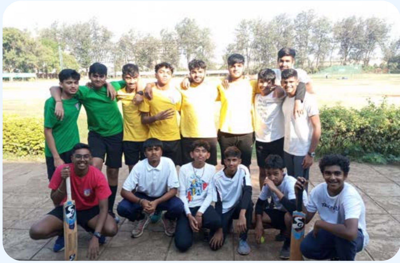
Against Nairobi International School, our under-15 boys' Cricket team lost by two runs.