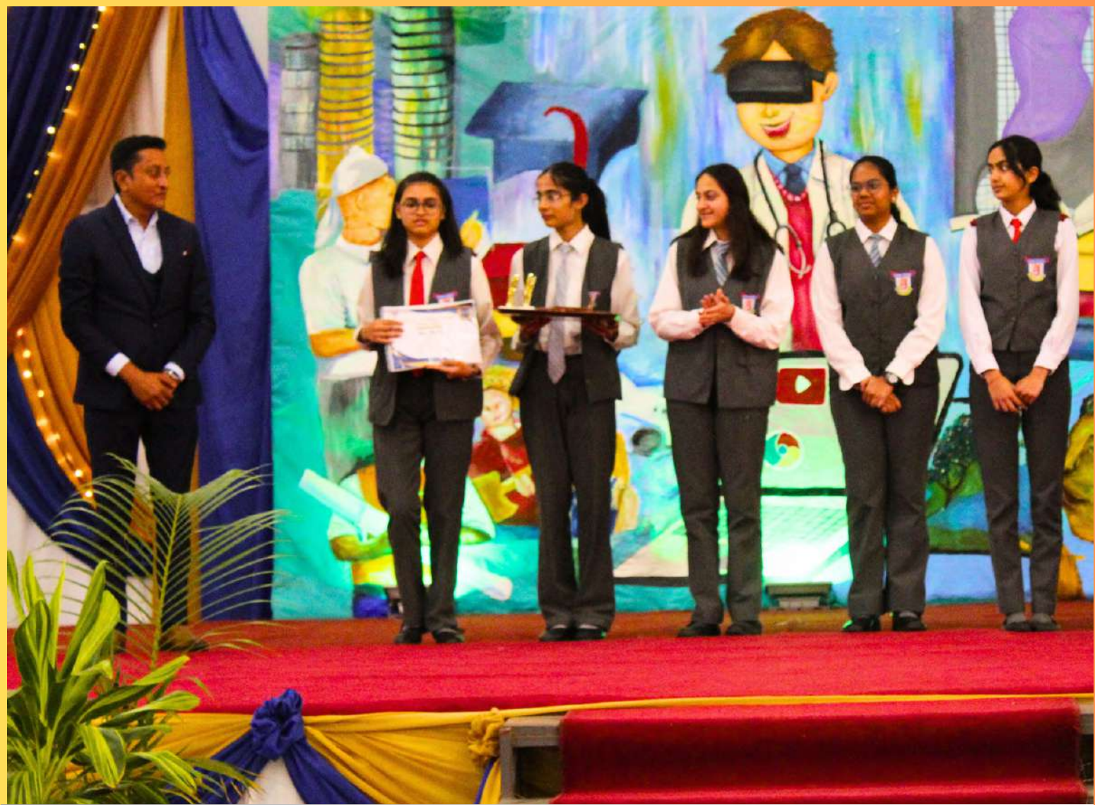
In this photo, students receive their hard earned awards.