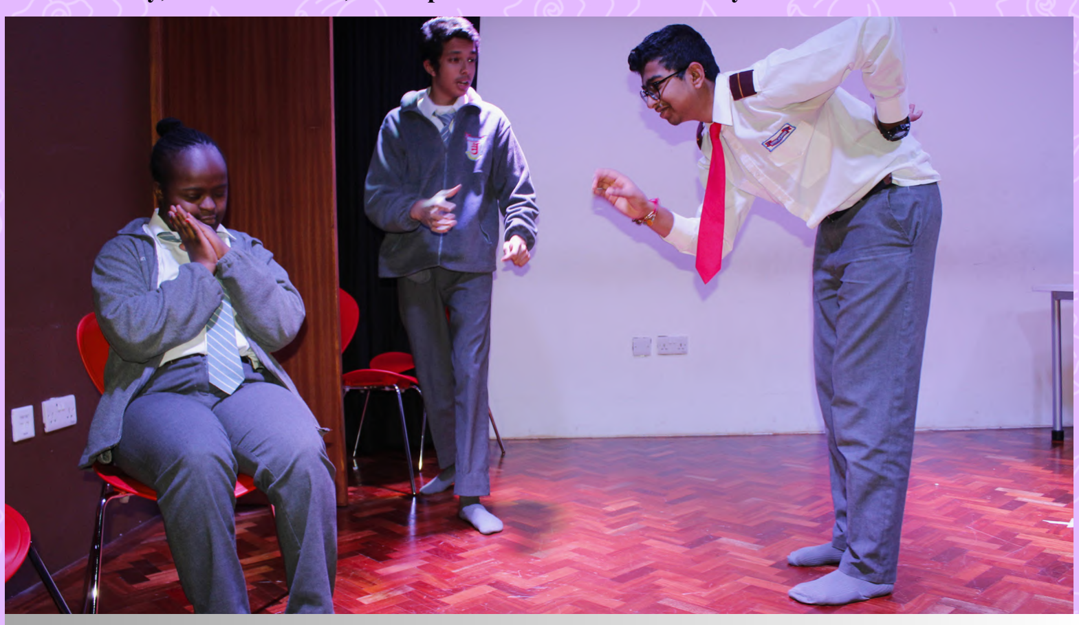
Inclusive Education Department students during Drama lessons.

In our drama classes, we celebrate the beauty of diversity and recognize that every student brings their own unique talents and strengths to the table. Through collaborative storytelling, improvisation, and character development, we create a safe and inclusive space that encourages students to explore their creativity, build confidence, and express themselves authentically.