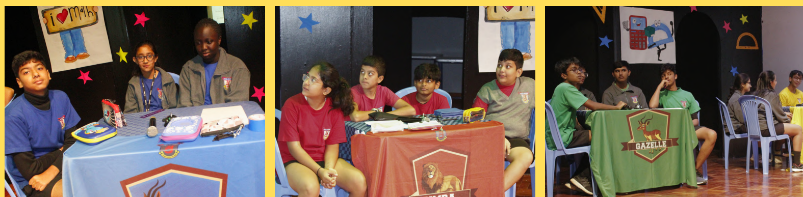
A collage of participants from various houses in action during the Annual Mathematics Quiz.