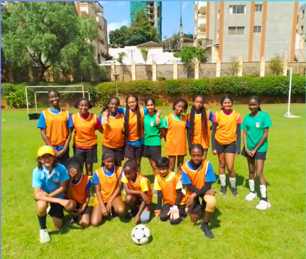
Under 13 Girls Football team represented the school on 16th Jan 2024 having a fixture against Samaj school. They won 3 goals against 1