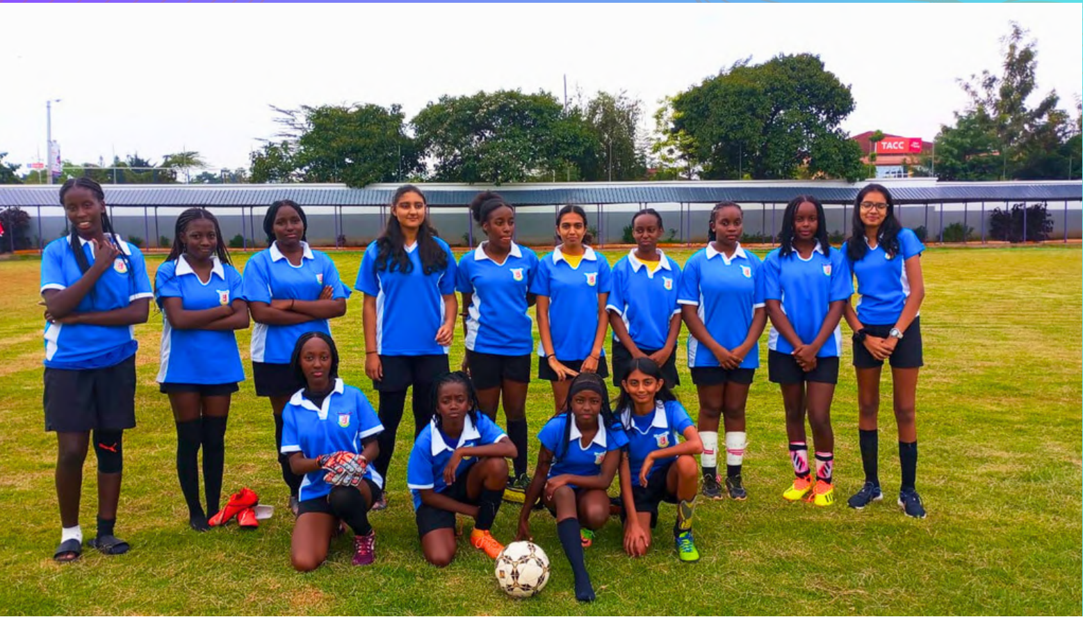
Under 15 Girls Football team represented the school in St.Austin school today for a fixture. They won 5 goals against 4

The sports department has been a beehive of activities with numerous opportunities for our students to engage in various inter-school sports competition.