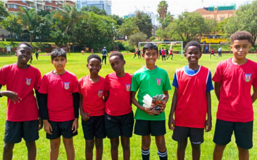
Under 13 Boys Soccer Team A won Samaj5-0