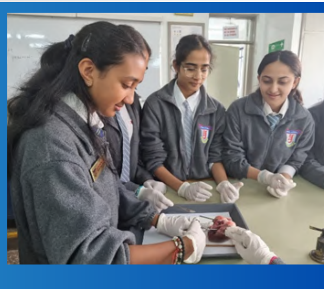
Year 10 students doing dissection, which allows our learners to delve deeper into understanding of biological structures.