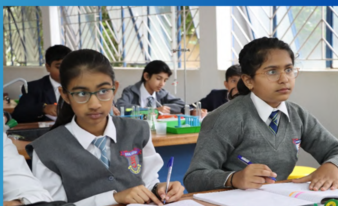
Year 7 students conducting an experiment on how to make colour indicators during the Chemistry lesson.