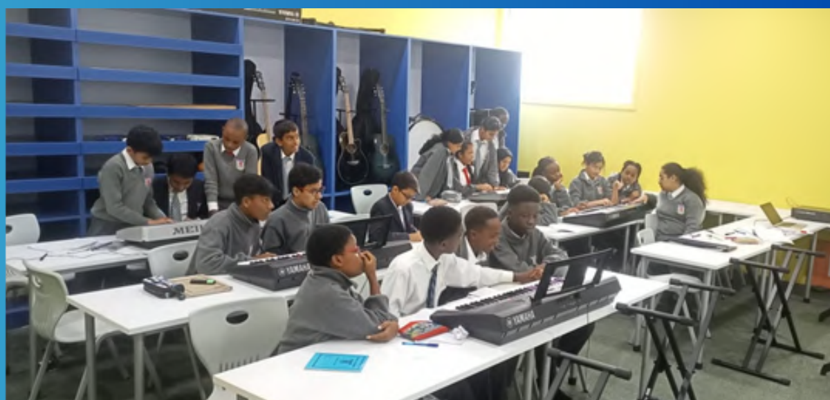
Year 8 students learning how to make melodies using a keyboard.