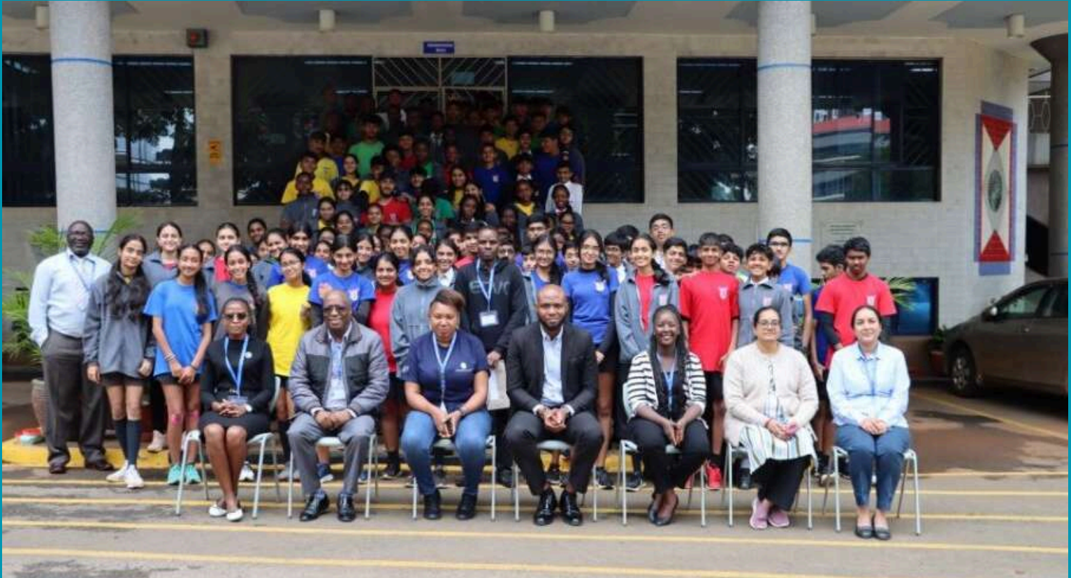
Group photo during the visit by President's Award officials