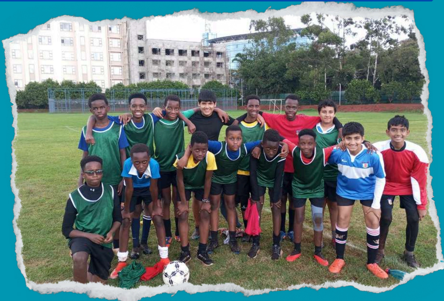
Our under 13 boys football team which played Premier Academy.