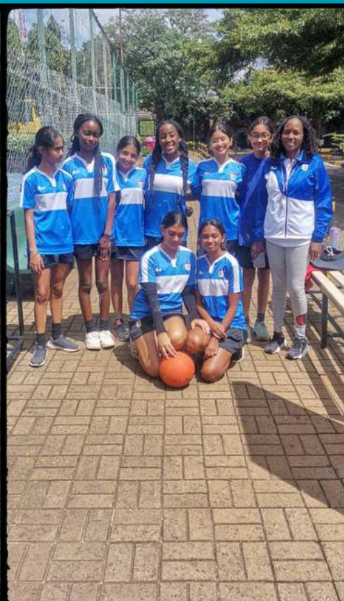
On 24th April our under 13 girls Netball team won against Premier Academy 13-10.