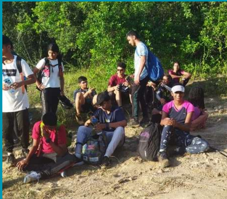
Student activities during the previous PA expedition