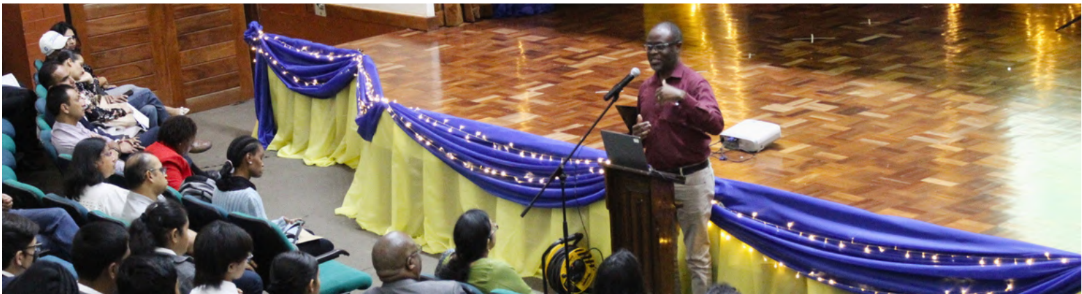
One of the invited guest speakers shares his vast experience about his field of specialization career wise.

The Academy takes this opportunity to once again appreciate in a very special way the professionals most of who are parents of the academy for offering to share their expertise with our Year 9 students. We also thank all our 9 parents, students and all teachers involved in huge success this was.