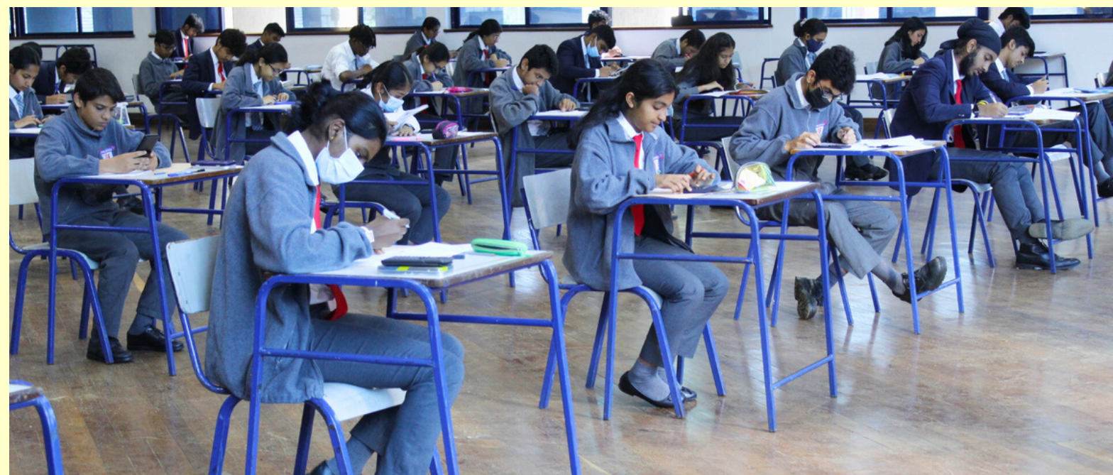
A section of the 54 students from Junior High sitting for the University of Waterloo Mathematics Contest 2023

For the past three years, our students have taken part in the University of Waterloo Mathematics contest and this has really helped them to drastically improve their skills in the subject. The program also presents students with an opportunity to compete with their peers across the world. On 6th April this year, 54 students from year 9, 10 and 11 participated in the competition and now we are waiting for the results patiently. Students will get certificates which will help them while applying for further studies at the University of Waterloo and other renowned world universities.