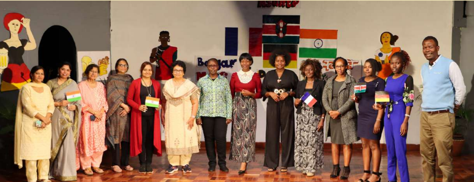
MFL department team together with the judges pose for a group photo after a successful MFL Elocution competition.

MFL Elocution Day at Oshwal Academy Nairobi Junior High is a vibrant celebration of language and self-expression. The event provides a platform for students to showcase their talent through poems and speeches, leaving an indelible mark on the hearts and minds of everyone in attendance. On Monday 22nd May, students gathered in the school auditorium, adorned with colorful decorations that reflected the diversity of languages and cultures represented at Oshwal Academy. The stage was set with a backdrop that depicted the beauty of words and the power of communication. Students from different grades took turns to deliver their carefully crafted poems and speeches, each one reflecting their unique perspectives and experiences which were captivating because of the eloquence and passion with which the students expressed themselves. The poems covered a wide range of themes, from love and friendship to social issues and personal growth.