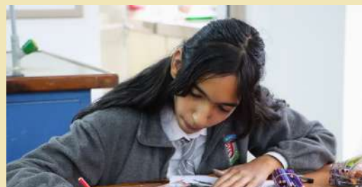
A section of the students who are using Art Work to campaign against environmental degradation and champion for conservation of the environment.