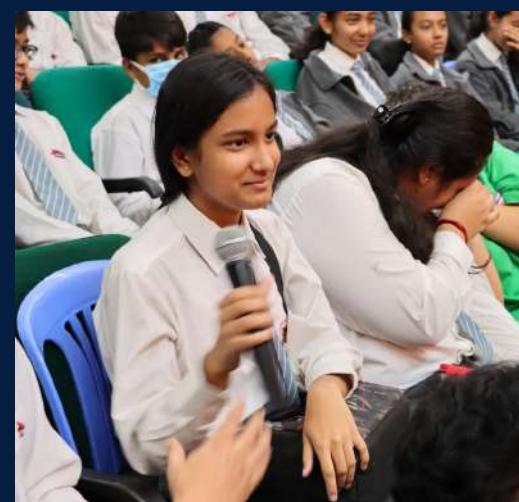
Question and answer session during the substance dependence and disorder talk.