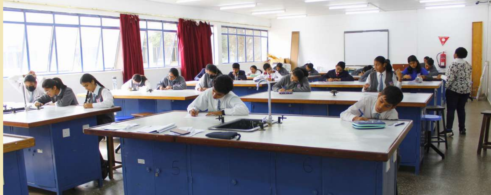
A section of the students who are using Essay writing to campaign against environmental degradation and champion for conservation of the environment.

The students participated in various categories; that is Art, Photography and Essay Writing in the following languages: Gujarati, Hindi, Kiswahili, German and French. The winners will be awarded certificates on 5th June 2023.