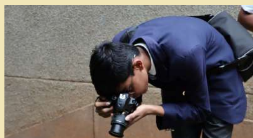
A section of students take photographs as part of the campaign against environmental degradation.