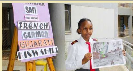
Students showcase their Art work on the theme “Beat Plastic Pollution”. during Mazingira Safi Day.