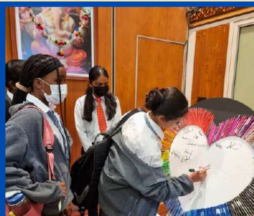
Some of our students signed the bulletin as a token of appreciation of the great work done by their peers from S.C.L.P Samaj School.