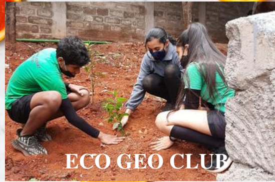
ECO GEO CLUB