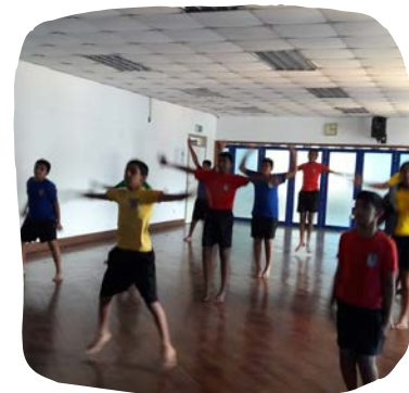
TAE KWONDO CLUB